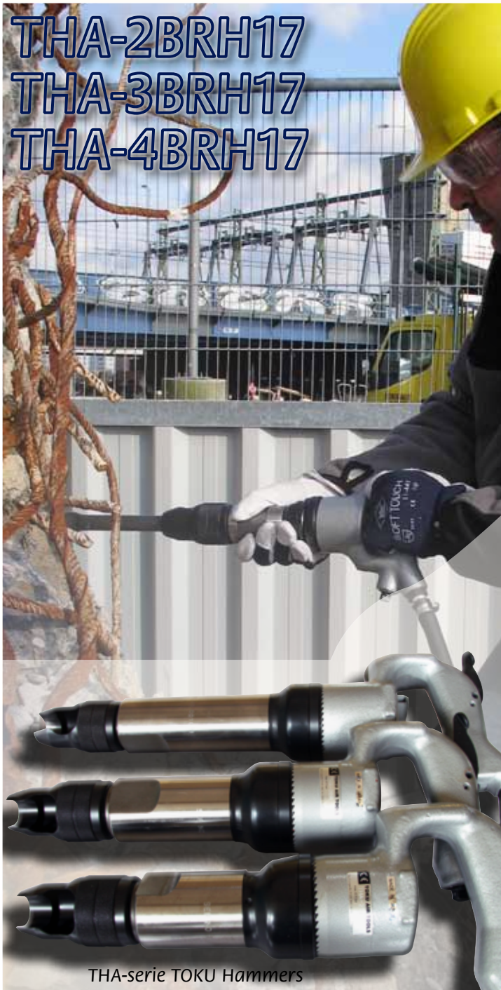
THA-serie TOKU Hammers

After successful introduction of the screw cap chisel retainers on TOKU's AA-series of hammers, we decided that the THH series of hammers will also be replaced by a version with screw cap chisel retainer. This screw cap also has a side entry, so you can use wide chisels as well. The new series of hammers have the type number THA. And just like its predecessor there are 3 different versions with different energy levels.